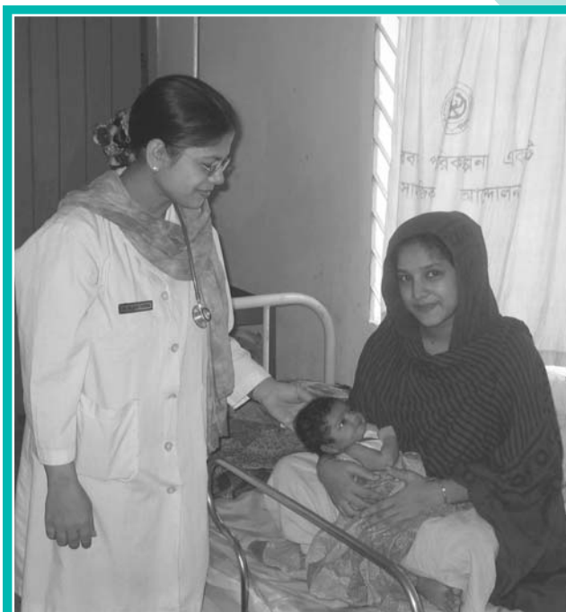
Provider with mother and child at subdistrict hospital, Lohagara, Bangladesh

As we strive to provide FP services to all who desire them, in the face of increasingly complex challenges, a return to the basics of care may be the way forward. The ACQUIRE Project promotes renewed, sustained focus on three essential service-delivery elements: informed and voluntary decision making; medical