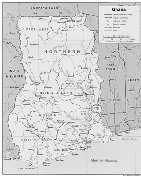
Figure 3. Map of Ghana

In a setting in which property, resources and offspring belong to men, women make their living and earn their status by helping men manage their households and resources and by giving them offspring. Childbearing is their single most important role in life. The emphasis on prolific childbearing stems from various factors such as the agrarian lifestyle which necessitates a large manual workforce, the tradition of having children fostered by relatives to strengthen ties across the extended family and high rates of child mortality.