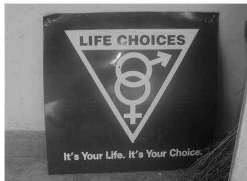
Figure 4. Logo and slogan of “Life Choices” campaign

The Life Choices campaign focused on factual information and perceptions to overcome myths or rumors. This was especially a challenge with vasectomy. The 2004 campaign created a positive and upbeat image for the method with the slogans “Get a permanent smile” and “ Wo ye berimah ” [You’re a real man]. Key messages were that the procedure is fast and simple and that virility is not affected. A panel study among 200 men in Accra before and after the campaign noted that the number of men “willing to consider vasectomy” increased three-fold and that the number who said they “would not consider a vasectomy” decreased.